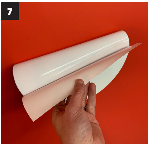
7 Peel and remove upper half of decal backing.