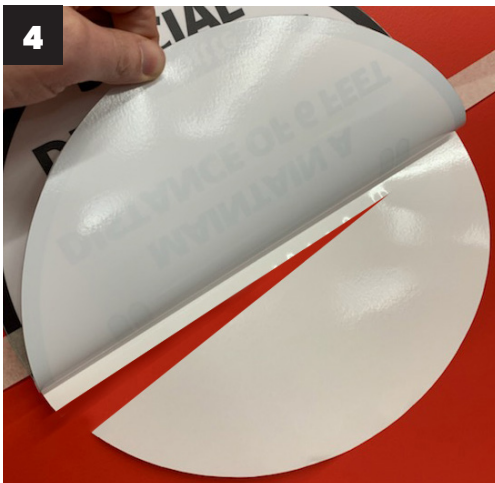
4 Peel and cut off bottom half of decal backing.