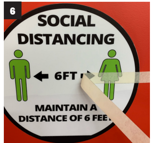
6 Remove masking tape "hinge".