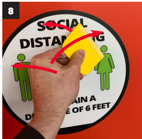
8 Using a decal application squeegee, press and apply decal to intended surface in pattern shown above. *