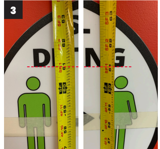
3 Use line of text as a place to measure from - so it's level.