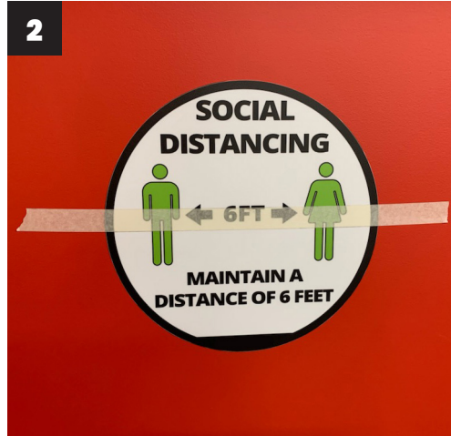
2 Use masking tape to temporarily adhere to intended surface and as a "hinge".