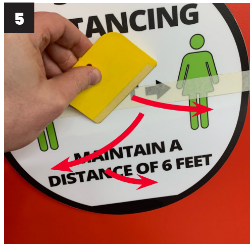
5 Using a decal application squeegee, press and apply decal to intended surface in pattern shown above. *