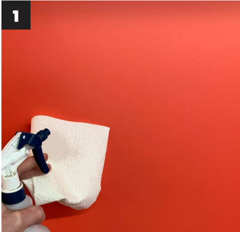
1 Clean surface